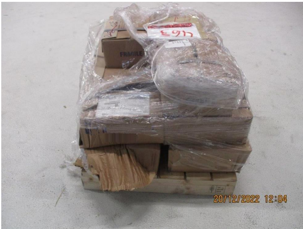
Example of a poor packaging and transport security