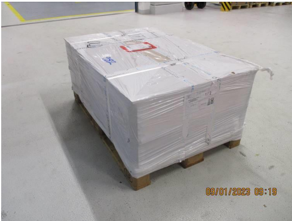
Example of a good packaging and transport security