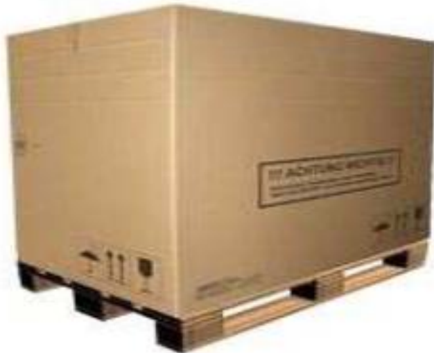
Example of a good packaging and transport security

THIS DOCUMENT WAS TRANSLATED FROM THE GERMAN VERSION OF THIS PROCEDURAL REQUIREMENT. IN CASE OF DOUBT OR AMBIGUITY, THE GERMAN VERSION IS THE LEADING DOCUMENT