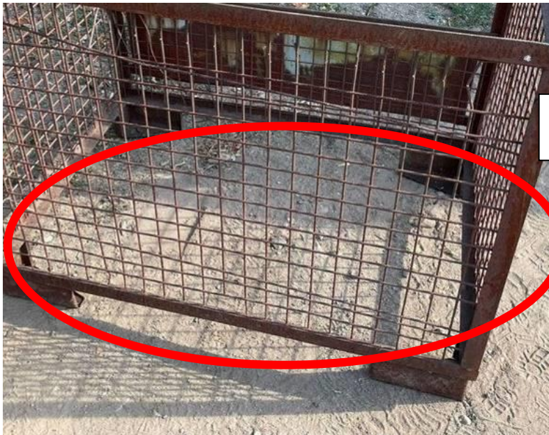
Floor boards are missing or damaged